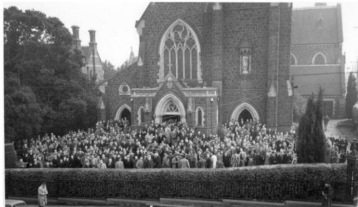
Monthly catch up after Confraternity Mass in the 1940s

The Confraternity functioned well because of its efficient organisation and structure. The parish was divided into 40 sections with each supervised by a prefect and sub-prefect. Prefects welcomed new parishioners to the parish, kept the parish census up to date, and tried to bring non-practising Catholics back to their faith.