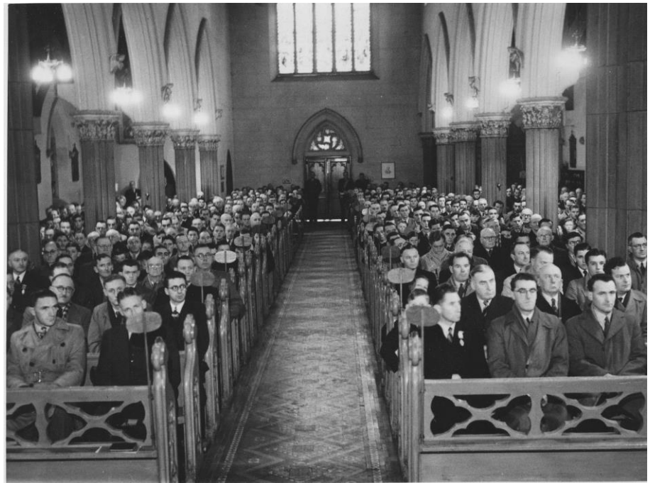
Confraternity Mass in the 1940s